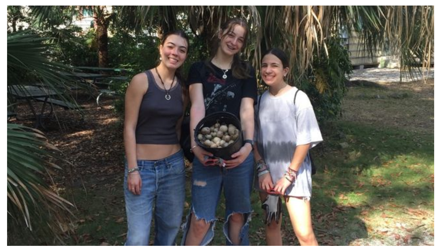
Photo: Volunteers joyfully display the bucket of invasive air potatoes they eradicated from our Steinberg Nature Center grounds!