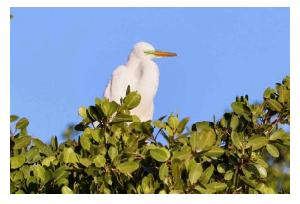
Top Photo: Magnificent Frigatebird. Second Row Photos: Brown Pelican (left); Great Egret.

In the early morning of February 21, TAS staff and Board members surveyed Mangrove Island and the Legion Picnic Islands for marine birds in north Biscayne Bay. Our team identified 23 bird species on or around the islands that lie off of Morningside Park, including Magnificent Frigatebird, Yellow-crowned Night-Heron, Little Blue Heron, Snowy Egret and even a state-threatened Tricolored Heron! Twelve species were roosting on the islands. Notably, Brown Pelicans were observed carrying nesting material, and several well-established Double-crested Cormorant nests were sighted. To view the survey results on eBird, click here.