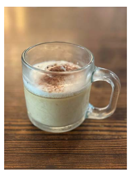
Photos from left: "Ferdinand the Bull" cocktail made with Sagamore Rye, Sweet Vermouth and housemade Grilled Blood Orange Cordial; Whisk Harvest Salad; Pumpkin Pie Panna Cotta.

The Birds Thank ... our kind neighbor and perennial community partner Whisk Gourmet. The endless generosity shown by the Whisk owners and managers year in and year out to our conservation organization — and, by extension, to birds and other wildlife — is nothing short of extraordinary. From stepping up this summer to again host our long-standing "Dine Out at Whisk Summer Series," to cooking up our signature Spring and Fall "Walk in the Woods with Wine and Whisk" alfresco dinners, our 56th Avenue "Whisker" friends are always there for us.