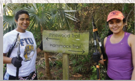
FIU Ecology Club members help steward the Steinberg Nature Center grounds at January Eco-restoration Work Day.