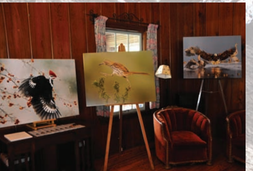
Awards perch every autumn in the Doc Thomas House for a month-long exhibit that is free to the public.