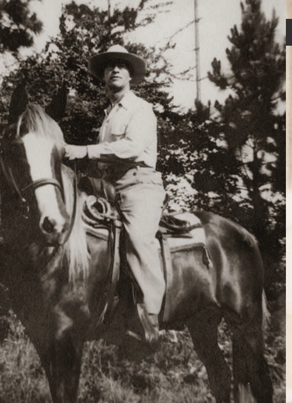
The O.K. Feed Store founder, pictured here in 1943, was often seen astride a horse; a stable once stood where the TAS chickee is sited now.