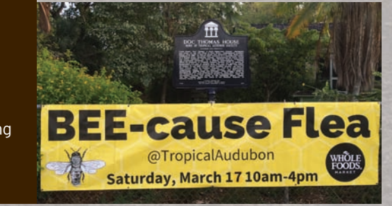
Annual BEE-cause Flea event.

Winners of National Audubon's Photography